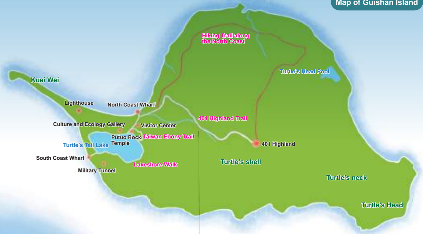
Map of Guishan Island

The Lakeshore Walk, with a total length of 650m, follows the shore of the tranquil and beautiful Turtle's Tail Lake. Along the walk, there are countless natural ecological sights for tourists to linger at, as well as one sculpture of Guanyin. It is the only place where you can overlook the rare native Chinese fan palm in Taiwan. Since the Turtle's Tail Lake was once connected to the sea, the landmark with the inscriptions-"Guishan Fishing Port" still stands at the area.