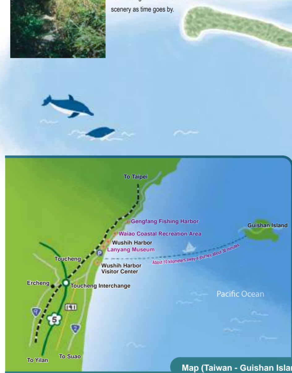
Map (Taiwan - Guishan Island)