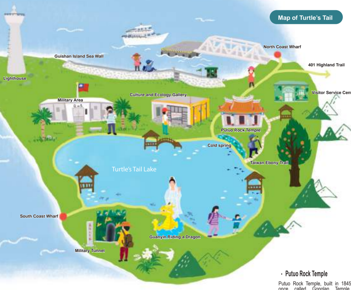
Map of Turtle's Tail

Guishan Island contains a large amount of Sulfur because of volcanic activity. The "Sulphur Smoke on Turtle Island" is a phenomenon formed by the erupted hydrogen sulfide and carbon dioxide.