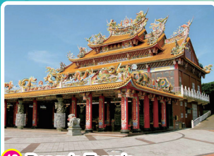
12 Dongxin Temple