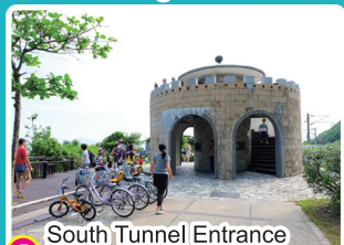
5 South Tunnel Entrance Recreational Area