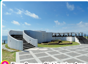
9 Four Square Sightseeing Area