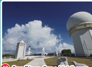
10 San Diego Cape Lighthouse