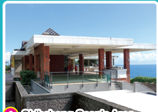
6 Shihcheng Scenic Area