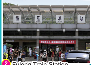
2 Fulong Train Station