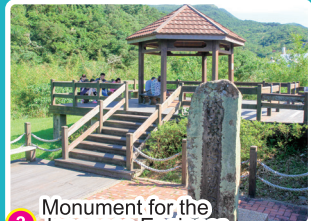
3 Monument for the Japanese Engineer