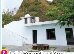
8 Lailai Recreational Area