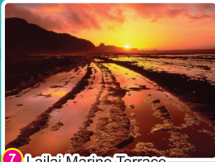
7 Lailai Marine Terrace