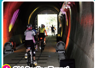
4 Old Caoling Tunnel