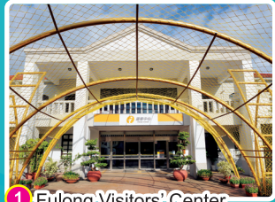
1 Fulong Visitors' Center

Caution: Hiking through the Old Caoling Tunnel is allowed on weekdays only. Due to the number of bicycle rider increases on weekend and holidays, please DO NOT walk into tunnel for safety reason. Inside the tunnel is wet and slippery, please slow down your speed.