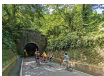
▲ North Entrance of Old Caoling Tunnel

Starting from Fulong Train Station, the Old Caoling Circular Line Bikeway offers routes of 10, 20, and 30 kilometers. The most suitable route for family cycling is approximately 10 kilometers long. It is recommended to start from Fulong Train Station towards the Old Caoling Tunnel, then return to Fulong Station after reaching the southern entrance of the tunnel. The entire route is flat and easy to ride, especially inside the tunnel where it's cool in summer and warm in winter - one of the classic cycling routes in northern Taiwan.