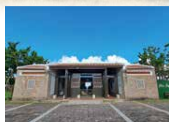
▲ Yanliao Beach Park (Blue Bay Park)

Beyond the suspension bridge, the path splits into the "Forest Trail" and "Coastal Trail," both of which merge later on. Each trail offers its own unique scenery, so it's worth exploring both on the outbound and return journeys. The route concludes at Yanliao Beach Park, where visitors can relax with afternoon tea, take a leisurely stroll along the beach, and admire the sea view. Additionally, the park features the Yanliao Resistance Monument, with informative boards detailing the historical events of the Yanliao resistance against Japanese invasion.