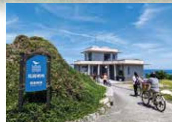
▲ Magang Empress Gallery

"Magang Empress Gallery" is located at the 107.7 kilometer mark on Provincial Highway No. 2. It is now a scenic café filled with artistic charm and boasting unbeatable ocean views. It's the perfect spot for exploring geological landscapes, viewing panoramic intertidal zones, and experiencing the breathtaking sea and sky.