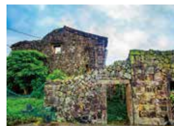
▲ Mao'ao Fishing Village - Old Stone Houses

About 5 kilometers further along the road from Fulong towards Yilan lies the fishing village of Mao'ao. The name "Mao'ao" is said to have originated from the resemblance of the bay to the Chinese character "凹" when viewed from a high place. The most characteristic feature of the fishing village is its old stone houses, showcasing the best examples of local materials being used for construction.