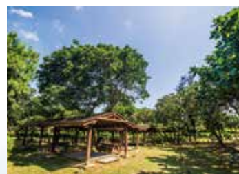
▲ Longmen Camping Site

Located along the southern banks of the Shuangxi River, the Longmen Camping Site spans 72 hectares of lush surroundings embraced by majestic mountains and tranquil waters. This retreat offers a wide array of camping and water-based activities, inviting you to embrace a natural lifestyle and fully immerse yourself in a rich vacation experience.