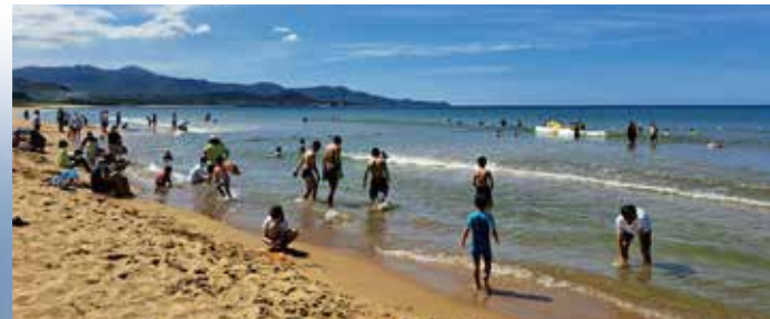
▼ ▲ Fulong Beach