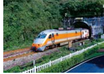
▲ New Caoling Tunnel