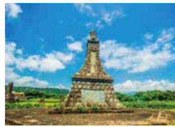
▲ Yanliao Resistance Monument