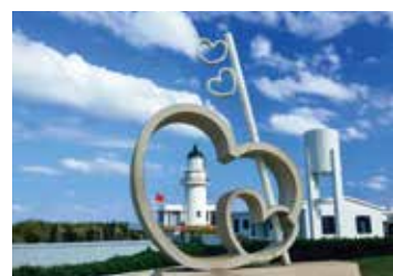
▲ Sandiaojiao Lighthouse