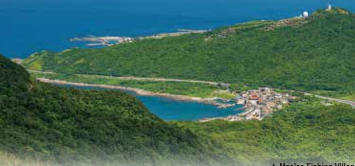
▲ Mao'ao Fishing Village

"Magang" is the easternmost fishing village in Taiwan, where traditional stone houses are still preserved. The wide coastal erosion platforms, intertidal zones, and vast coastal scenery around Magang Fishing Port are all worth visiting.