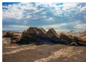
▲ Lailai Geological Zone - "Fire Dragon Rock"

Its remarkable landscape features unique formations like the "Devil's Washboard," where black rocks stand against crashing waves, and the "Fire Dragon Rock," resembling a submerged dragon's back. From here, one can admire Guishan Island in the distance, along with stunning sea vistas. Travelers should exercise caution during winter due to potentially larger waves, prioritizing safety during sightseeing and photography.