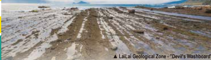
▲ Lailai Geological Zone - "Devil's Washboard"