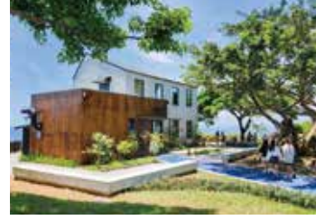
▲ Cliffside Cottage