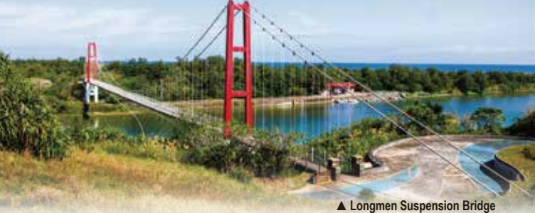
▲ Longmen Suspension Bridge

The Longmen-Yanliao Bikeway, stretching between Fulong and Yanliao Beach Park, begins at the Provincial Highway 2 bicycle lane near the Fulong Visitor Center. Around kilometer 99 of Provincial Highway 2, just after passing the entrance gate of the Longmen Camping Resort, cyclists can turn downhill to reach the Longmen Suspension Bridge. Spanning the Shuangxi River with its striking red towers, this 200-meter-long bridge offers panoramic views of the riverside and surrounding mountain and sea scenery, making it a must-see landmark along the route.