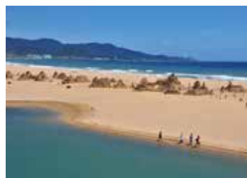
▲ Fulong Beach

Fulong Beach boasts golden sand beaches, where the Shuangxi River meets the sea. This beach is embraced by the Pacific Ocean and the Shuangxi River, creating an unique dual landscape of the river and sea. The crescent-shaped Rainbow Bridge connects the two areas, leading visitors to the ocean beach. Well-known events include the Fulong International Sand Sculpture Art Festival and the Hohaiyan Rock Festival.