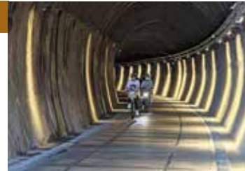
▲ Old Caoling Tunnel

The "Old Caoling Tunnel," stretching 2,167 meters between New Taipei and Yilan, is immortalized in the Taiwanese folk song "Diu Diu Don-Ah." Once abandoned for over two decades due to railway realignment, it reopened in 2008 as a cycling path. This tunnel boasts a consistent warm temperature in winter and coolness in summer, providing a delightful 20-minute ride. Popular photo spots include the inscribed doorframes at the northern and southern entrances, labeled "Zhitianxian" and "Baiyun Feichu." At the southern entrance, visitors can witness trains emerging from the new Caoling Tunnel from the observation deck. Adjacent to the southern entrance is the Cliffside Cottage (Shicheng No. 9 Café), a charming hidden coffee shop boasting breathtaking sea views and a distant view of Guishan Island.