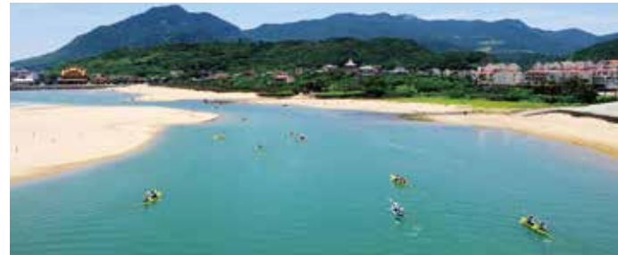
▲ Fulong Kayaking Activity

This is also a popular spot for visitors to engage in fun water activities like canoeing, windsurfing, stand-up paddleboarding, and surfing. Water sports enthusiasts should not miss out!