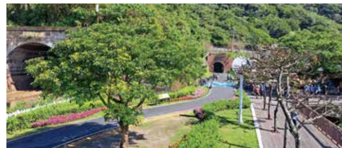
▲ Old Caoling Tunnel South Entrance

Fulong town is a treasure trove of stories, inviting you on a cultural odyssey. Its stunning mountain and sea vistas captivate visitors, while its local charm beckons them to linger. Experience the serenity and authenticity of Fulong amidst railway tracks and sea breezes, immersing yourself in its rich tapestry of life and lore.