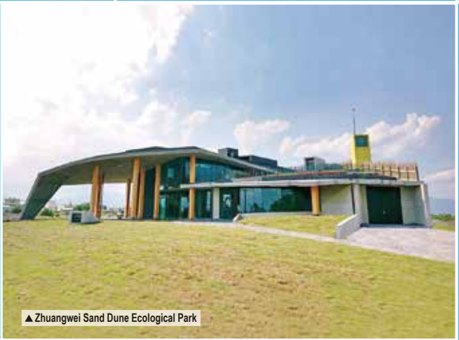
▲ Zhuangwei Sand Dune Ecological Park

The Zhuangwei Sand Dunes Ecological Park, designed by renowned architect Sheng-Yuan Huang, seamlessly integrates with Yilan's natural landscape. It preserves the continuous coastal dunes and unique flora and fauna as the showcase for visitors to explore and experience. The exhibition area is equipped with a visitor center, exhibition spaces, and a shop, making it a perfect destination for strolls at dawn, sunset, or moonrise, where you can listen to the sounds of the waves and enjoy scenic views. It has become a new highlight of Yilan's international charm.