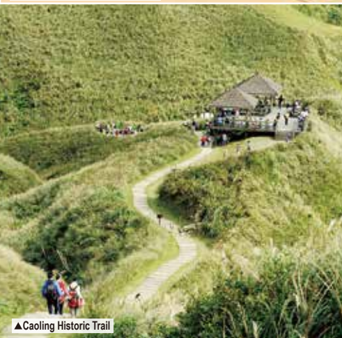
▲ Caoling Historic Trail