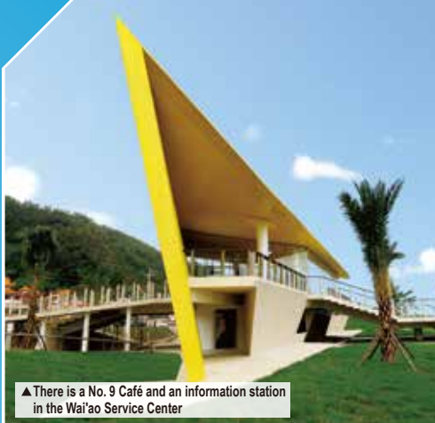
▲ There is a No. 9 Café and an information station in the Wa'ao Service Center

Recently, to enhance the quality of tourism services, the well-known yellow-themed Wa'ao Service Area has introduced a friendly and helpful information service, creating a welcoming environment for domestic and international tourists.