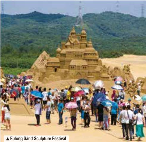
▲ Fulong Sand Sculpture Festival