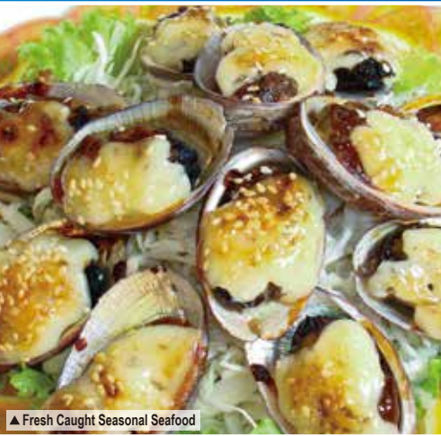
▲ Fresh Caught Seasonal Seafood

The Northeast Coast is abundant with diverse seafood, and in areas like Bitou, Longdong Bay, Auding, Fulong, Gengfang, Wushigang, and Nanfang'ao, you can savor fresh and delicious seafood feasts. Shrimp, clams, live fish, and various crabs are some renowned specialties here. Examples include the abalones and sea urchins from Bitou and Longdong, the small-scale black and white fishes as well as oval squid from Fulong and Auding, the giant slipper lobster from Toucheng and Wushigang, and the cod from Nanfang'ao. These are all classic marine delicacies along the Northeast Coast to Yilan's coastline.