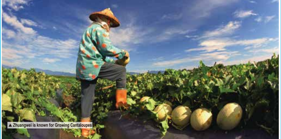
▲ Zhuangwei is known for Growing Cantaloupes

Zhuangwei Township is situated on the lower reaches of the Lanyang River, where the abundant sunlight and sandy soil are perfect for growing various melons and fruits. June and July are the peak harvest season for cantaloupes, and this is when the Zhuangwei Farmers' Association holds the Cantaloupe Festival.