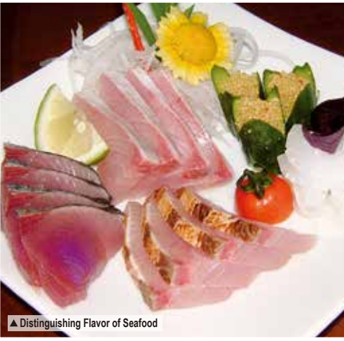
▲ Distinguishing Flavor of Seafood